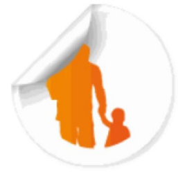
Fig. 2 Materials used for Environmental information in message nudge